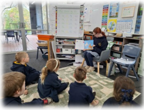
Storytime reading to the younger children is a great way to build confidence and practise public speaking skills.