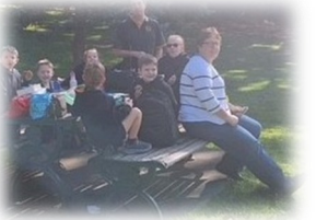
Enjoying the sun in the park.