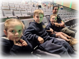
Enjoying the show with friends.